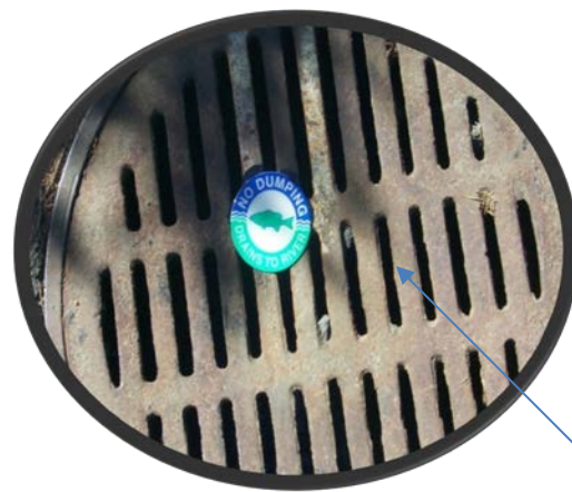
Stormwater Catch Basin