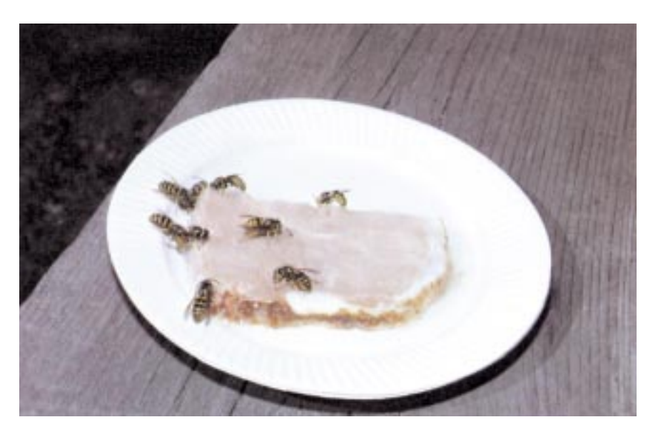
Western yellowjacket workers often scavenge for meat or sweets at picnics. Workers will feed pieces of meat to developing larvae in the nest.

Underground nests. Use a registered hornet and wasp spray. Direct the material into