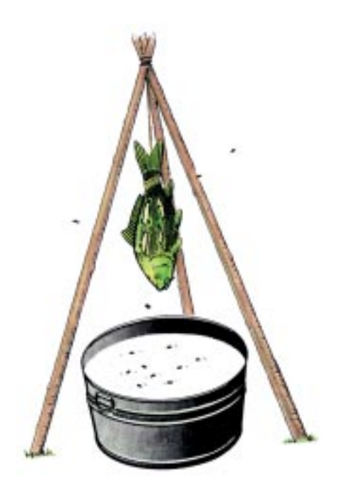
Suspended fish bait trap.