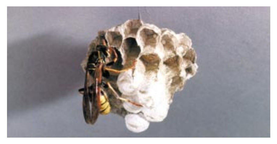
Paper wasp queen, Polistes aurifer (= fuscatus aurifer ), tending aerial nest.

A typical yellowjacket worker, Vespula pensylvanica, is shown on the cover. Yellowjacket workers are about 1/2 inch long, and appear short and stocky. All yellowjackets are yellow and black or white and black. Paper wasps are up to 3/4 inch long, and are more slender (see cover). Paper wasps may be distinguished from yellowjackets by their more slender body shape